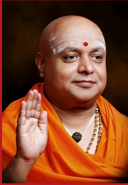
Paramapoojya Jagadguru Padmabhushana Puraskrutha Sri Sri Sri Dr. Balagangadharanatha Mahaswamiji 71 st Pontiff, Sri Adichunchanagiri Mahasamsthana Math

"Live like a Butterfly... take the best without destroying or hurting anybody but giving pleasure to everyone"